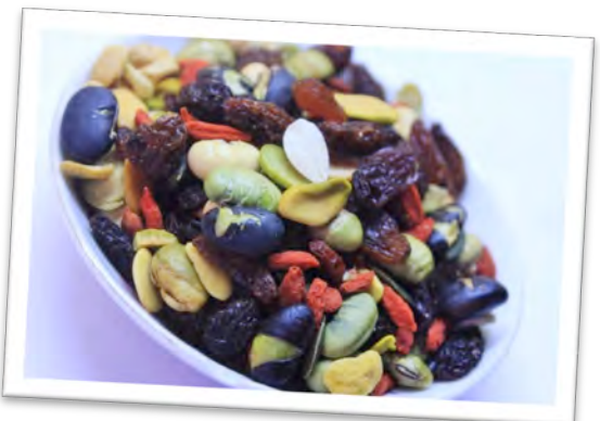
Simple: Almonds, dried cherries, dark chocolate chips, sea salt, cinnamon.

Everyone has their own nutritional and tasterelated needs, so we listed these mix ideas without set ratios or measurements. There are no rules for trail mix—combine whatever sounds good!