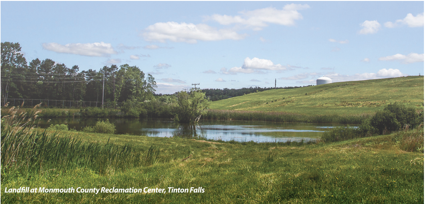
Landfill at Monmouth County Reclamation Center, Tinton Falls