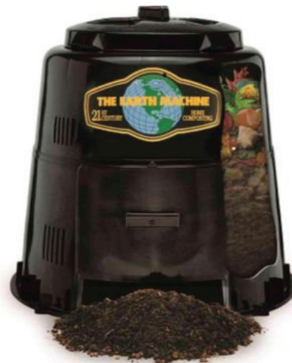
Left: Composting display at Deep Cut Gardens, Middletown. Right: “The Earth Machine” recommended by Monmouth County for home gardening composting.