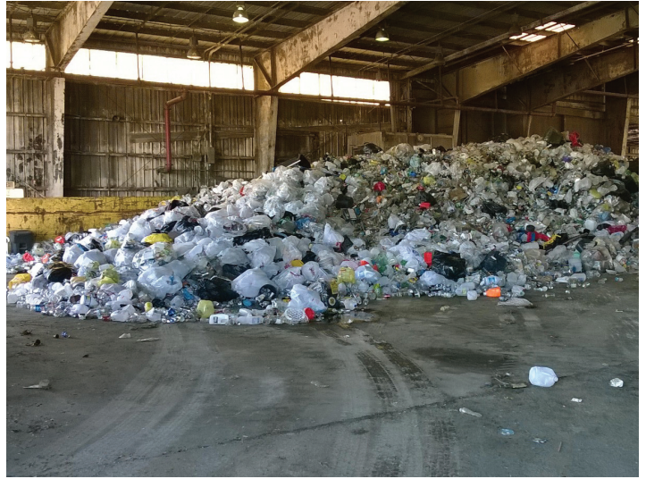
LEFT: All the garbage in Monmouth County is brought to the Reclamation Center in Tinton Falls where it is compacted then placed in the landfill. RIGHT: Recycling facility

If you live in Monmouth County, the following items must be recycled (they are banned from the landfill). SEE CHART (PP. 6-9) FOR INSTRUCTIONS ON WHERE TO RECYCLE.