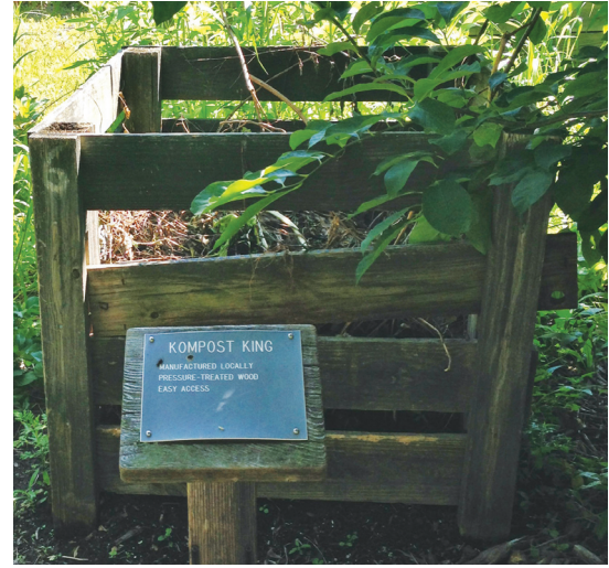
ABOVE; LEFT and RIGHT: Two styles of composting bins.